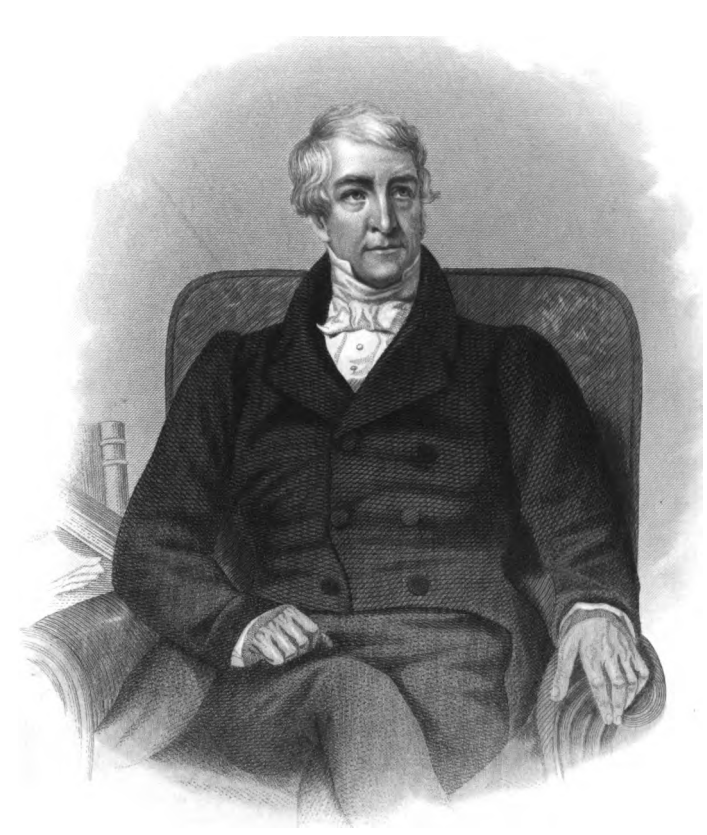
Engity Geo E Perma New York